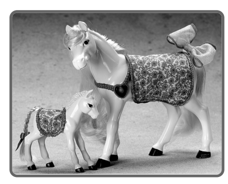
Powder & Baby Precious 75394